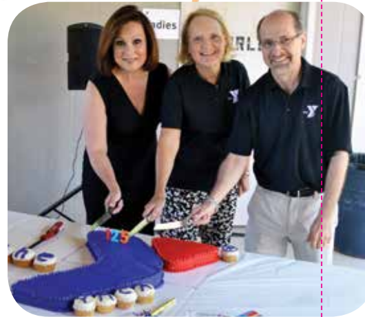
125th Cake Cutting Ceremony at Spears Family Y