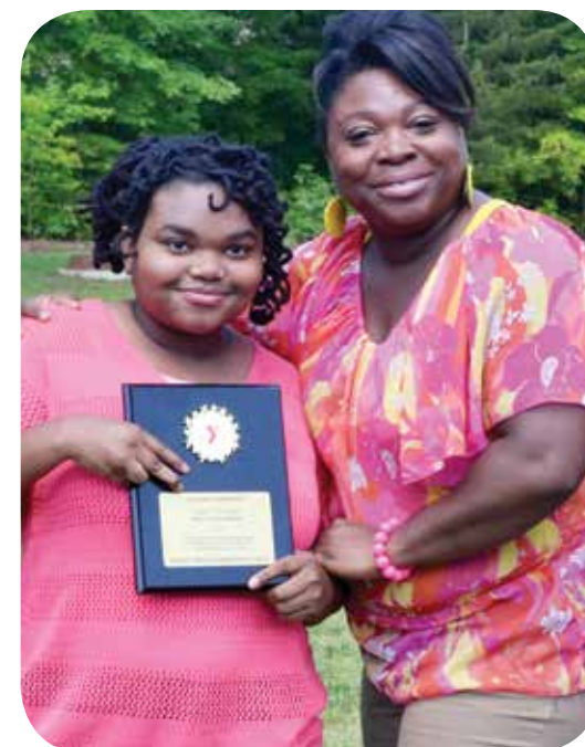
Youth of the Year recognition event