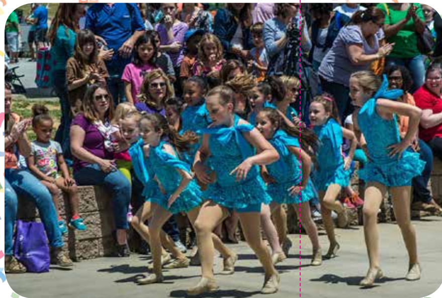
Dance troupe performing at the 125th Celebration at Spears Family Y