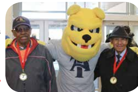
Hayes-Taylor Y Grand Opening Celebration