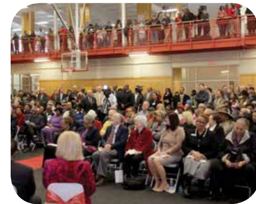
Hayes-Taylor Y Ribbon Cutting Ceremony