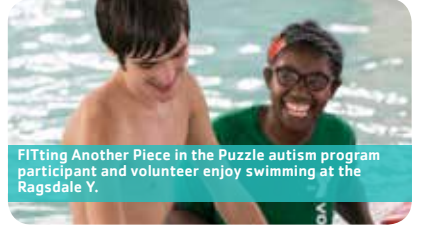
FITting Another Piece in the Puzzle autism program participant and volunteer enjoy swimming at the Ragdale Y.