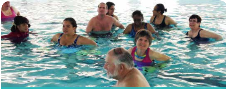
Through a grant, the Spears Y offers aquatic exercise classes for participants with MS.

For the YMCA of Greensboro, 2015 was an exciting year in service to our community. Throughout our Y we are living our cause and serving our community in greater numbers and with a more intense focus on meeting specific needs than ever before. Even as our traditional programs continued to meet the ongoing needs of our participants, here are some of the exciting things that our staff and volunteers made happen last year to meet some special needs in our community.