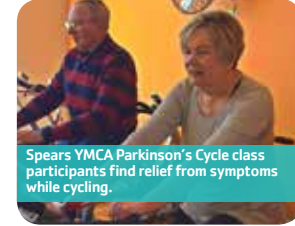
Spears YMCA Parkinson's Cycle class participants find relief from symptoms while cycling.