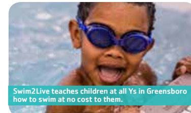
Swim2Live teaches children at all Ys in Greensboro how to swim at no cost to them.