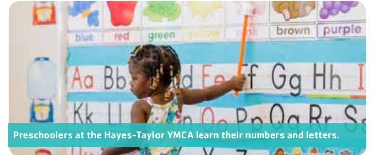
Preschoolers at the Hayes-Taylor YMCA learn their numbers and letters.