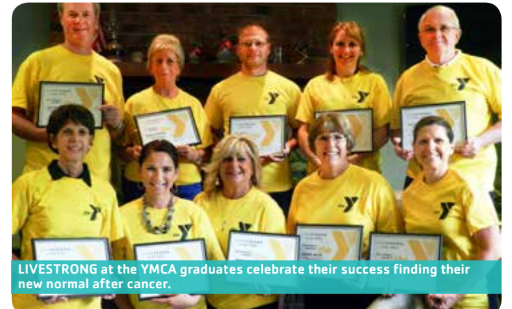
LIVESTRONG at the YMCA graduates celebrate their success finding their new normal after cancer.